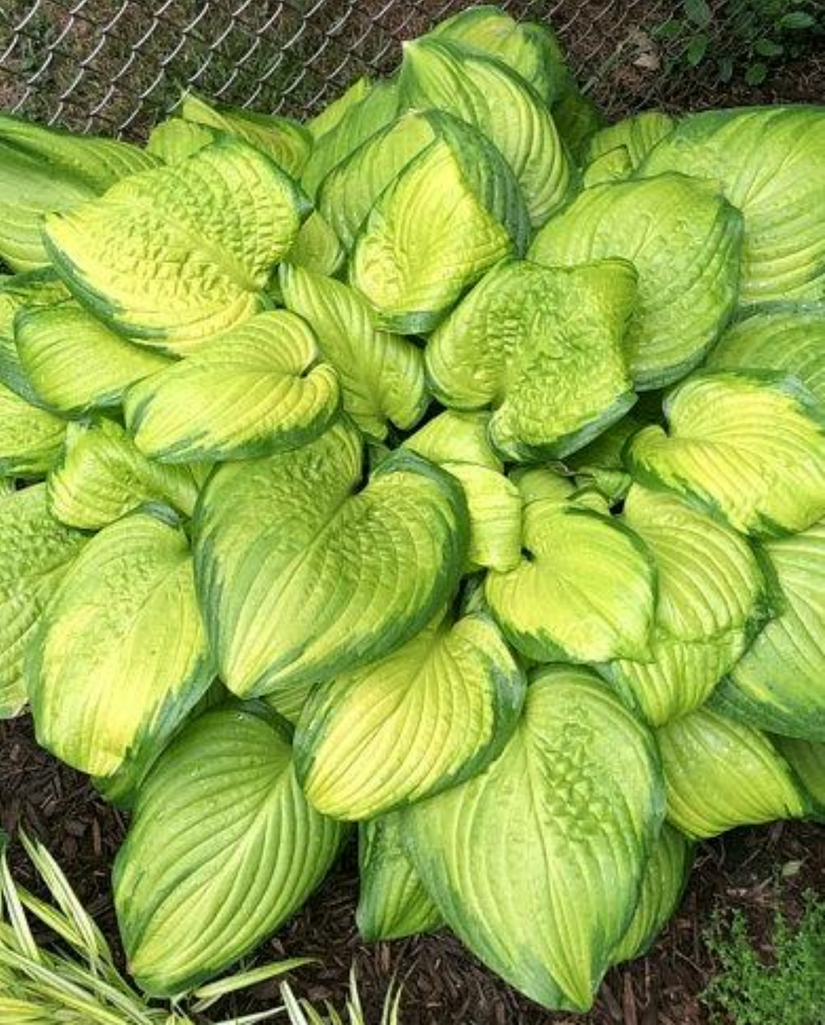
H. 'STAINED GLASS' 2006